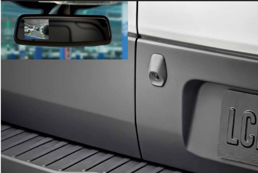
Rear View Camera ការមើរក្រោយជំនួយក្នុងការចូលចត