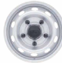
16" White Steel with Mini-Cap and Lug Nut Covers