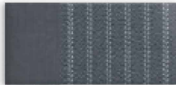
2. Pewter Cloth