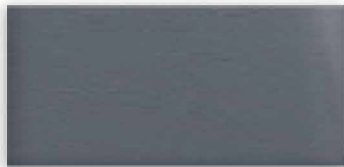
1. Pewter Vinyl