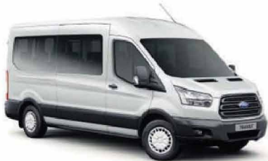
Oxford White Solid body colour