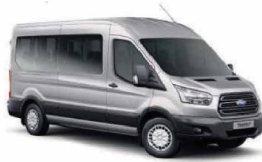
Ingot Silver Metallic body colour*