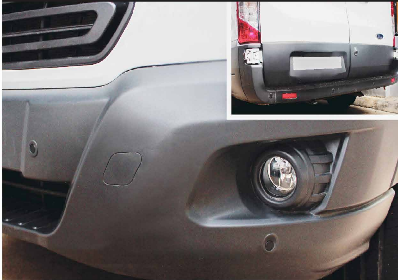
Sensor ផ្តល់សញ្ញាឧបសគ្គនៅខាងមុខ និង ខាងក្រោយ