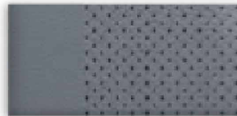
3. Pewter Leather