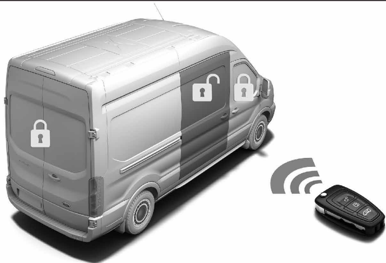
Smart Key ទំនើប និង ងាយស្រួលក្នុងប្រើប្រាស់