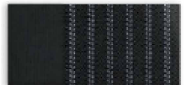
4. Charcoal Cloth